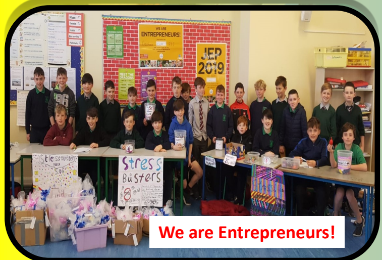
We are Entrepreneurs!