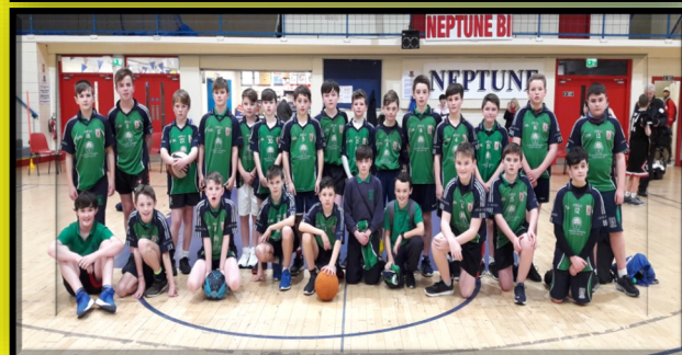
Pictured at the recent rugby and basketball blitzes.