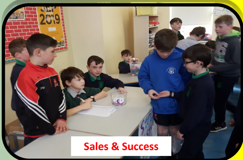
Sales & Success