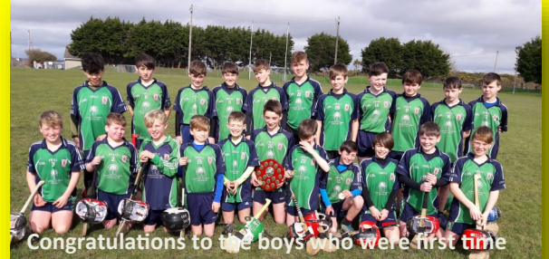
Congratulations to the boys who were first time winners in the Carrighoun hurling tournament.