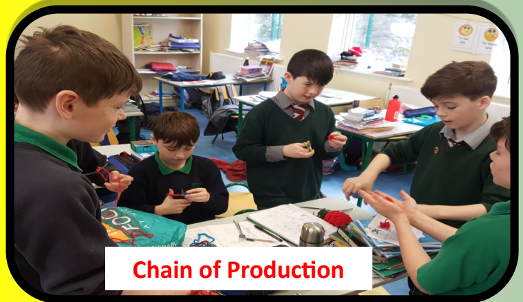
Chain of Production