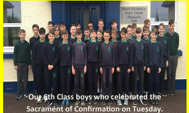
Our 6th Class boys who celebrated the Sacrament of Confirmation on Tuesday.